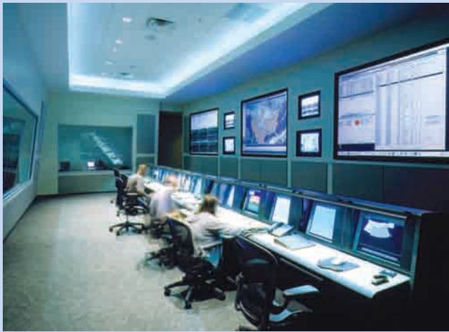
An innovator of internet banking technology, S1 Corporation required a state-of-the-art datacenter with on-site operations command. The facility includes 1,000-SF control center featuring three 100 inch rear projection screens and custom consoles in a raised access floor environment.

The aeronautics industry offers some direction toward solutions. The harsh environment of outer space requires