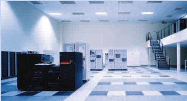
The S1 Technology Center in London required a state-of-the-art datacenter with on-site, 24/7 operations control center for European operations. Features of the facility include redundant power with UPS and generator backup, dual fiber optic feeds and interconnectivity between the Norcross, Georgia and London datacenters allowing for dual control of network traffic, adding another level of redundancy. Client server racks are located on the main level, while network racks are located on the mezzanine level providing separation of Internet and Intranet traffic.

Diesel generators have their own inherent problems. Compared to natural gas, diesel fuel can sometimes fall into short supply. Thus, facilities must store sufficient supplies – enough to keep the generators running for 24, 48, or even 72 hours. Facility owners must then determine how much fuel to store, how to store it, and how to address the fire hazard. Some owners or facilities may desire to deal with these issues by burying the tanks, which necessitates EPA regulations.