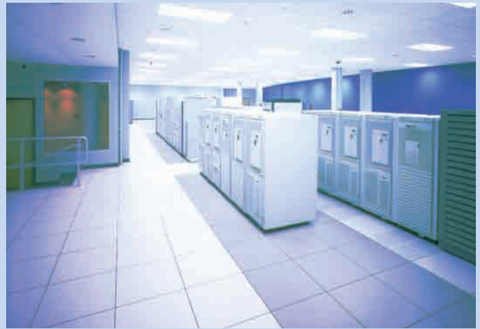
12,000-SF datacenter on a 12-inch raised floor with N+1 redundancy for cooling and electrical infrastructure.

Norcross Technology Center, Norcross, Georgia